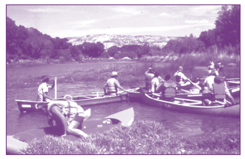
Canoeists at the District of Columbia's Camp Riverview explore the coastal wetlands located near their site.

Wetlands benefit our communities as well. They replenish and clean water supplies and reduce flood risks, provide recreational opportunities and aesthetic benefits. They serve as sites for scientific research and education, and benefit commercial fishing.